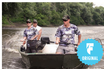
WORLD FISHING JOURNAL SUNDAY 11:30 AM ET